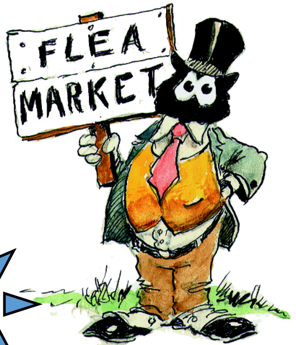
Table Requests will begin on October 14

Forms Available ONLY in the Clubhouse for residents only